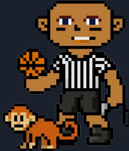
Habib Lichaa @hlichaa