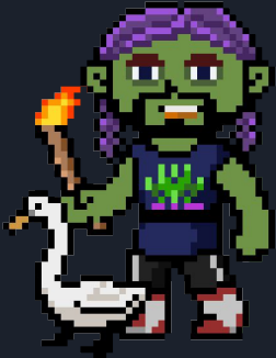
Bruce the Goose @xbrucethegoose

We are a rag tag group of NFT veterans determined to raise the bar in the world of digital collectables.